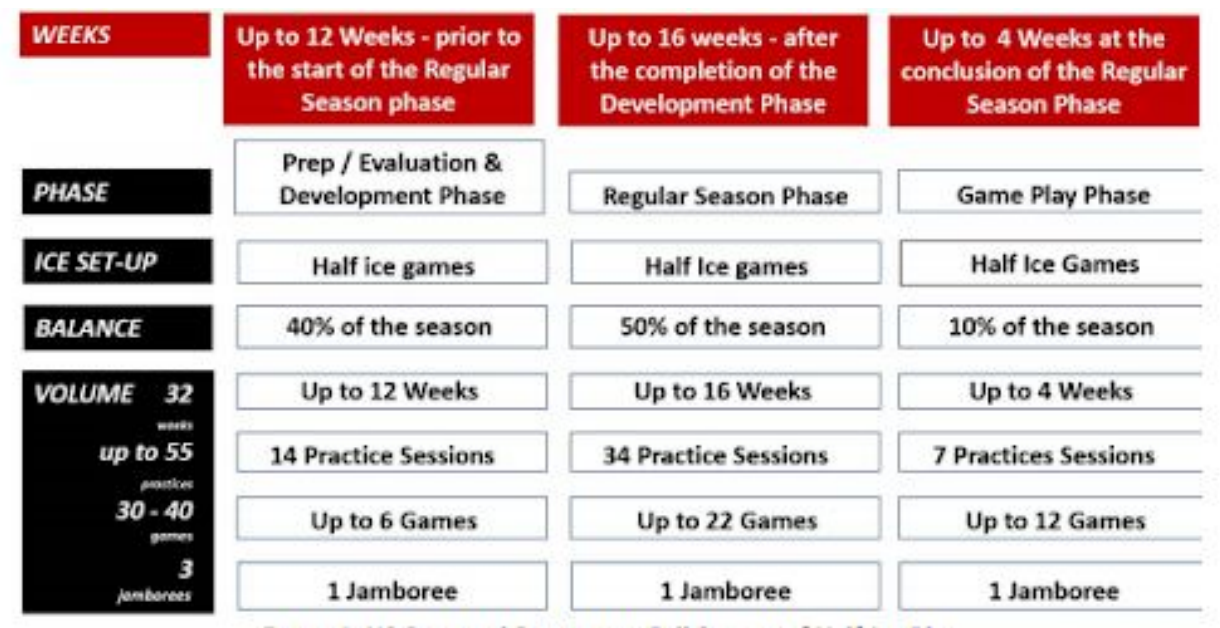
FIGURE 1: U9 Seasonal Structure - Full Season of Half-Ice Play

Below is an image that will help give a visual of the various phases and overall structure of the season: