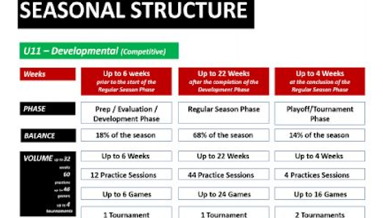
Chart 2: Seasonal structure components for developmental (competitive) U11 hockey

Below is a visual image to help outline the season structure as well: