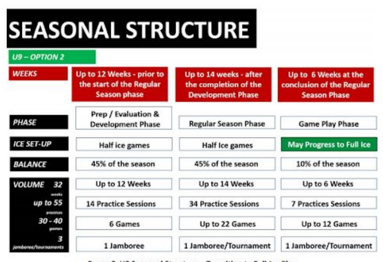
FIGURE 2: U9 Seasonal Structure - Transition to Full-Ice Play

Below is an image that will help give a visual of the various phases and overall structure of the season: